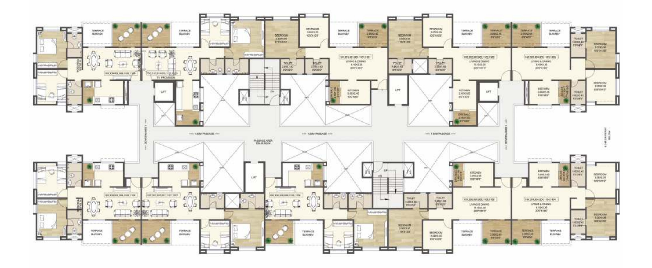
1st, 3rd, 5th, 9th, 11th & 13th floor plan