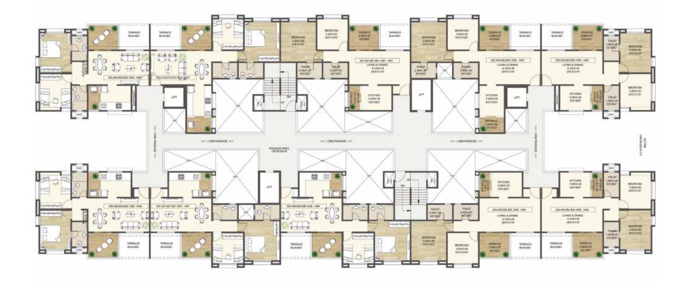
2nd, 4th, 6th, 8th, 10th & 14th floor plan