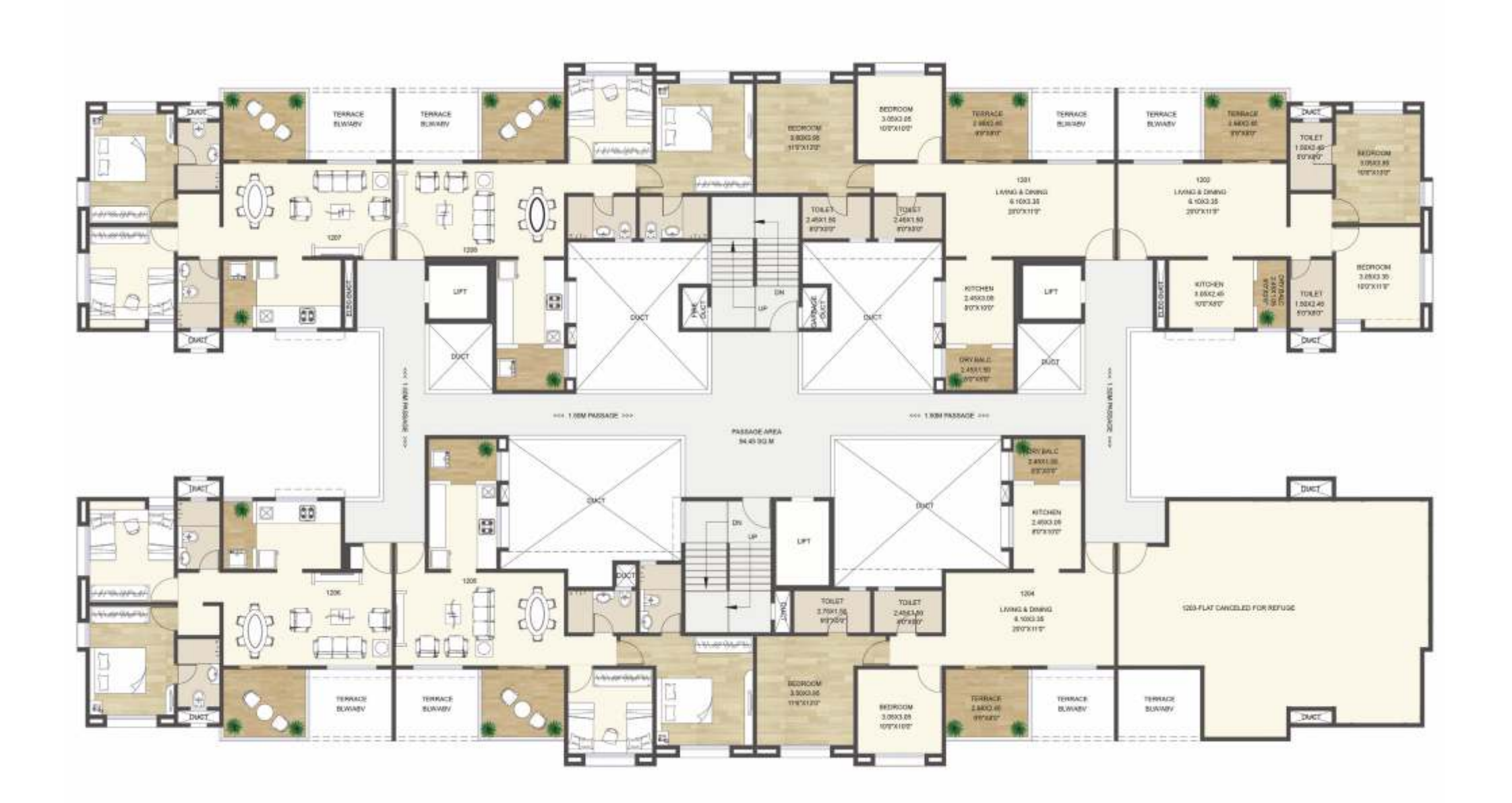
12th floor plan