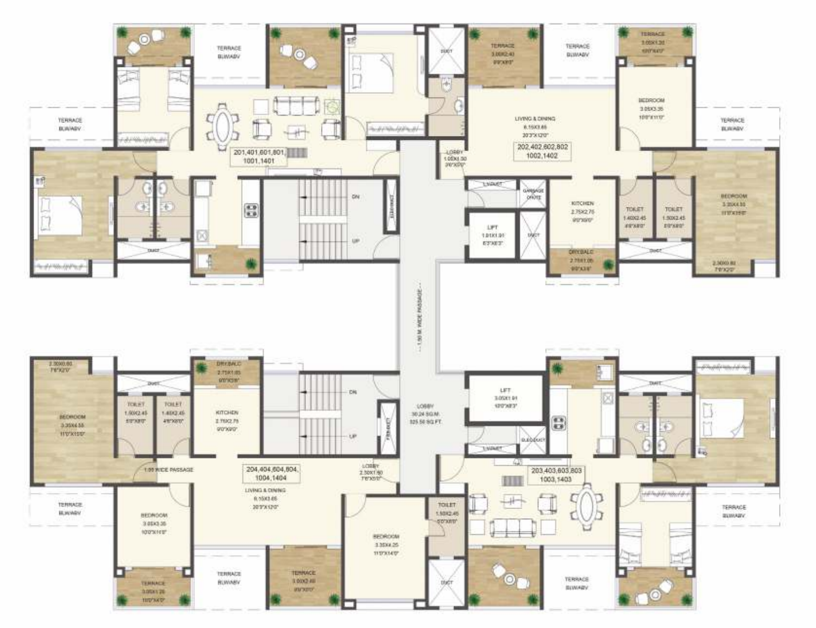
Typical 2nd, 4th, 6th, 8th, 10th & 14th floor plan