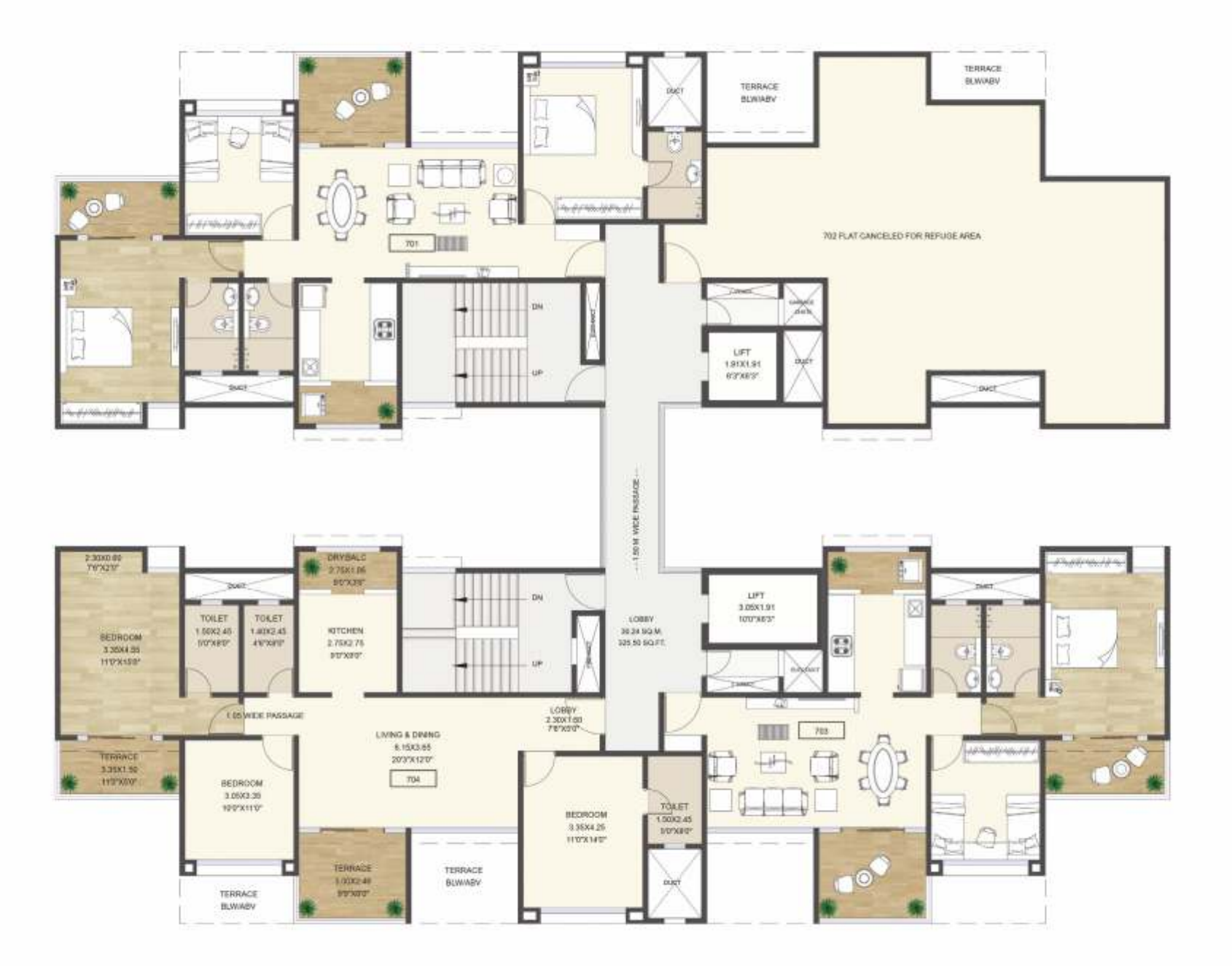
Typical 7th Refuge floor plan